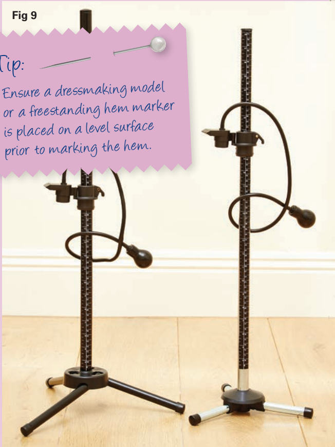
Fig 9 Tip: Ensure a dressmaking model or a freestanding hem marker is placed on a level surface prior to marking the hem.

Freestanding versions of the chalk hem marker in a choice of metal or plastic are also available as shown in Fig 9 . With freestanding markers the person wearing the garment applies puffs of chalk at selected positions around the skirt.