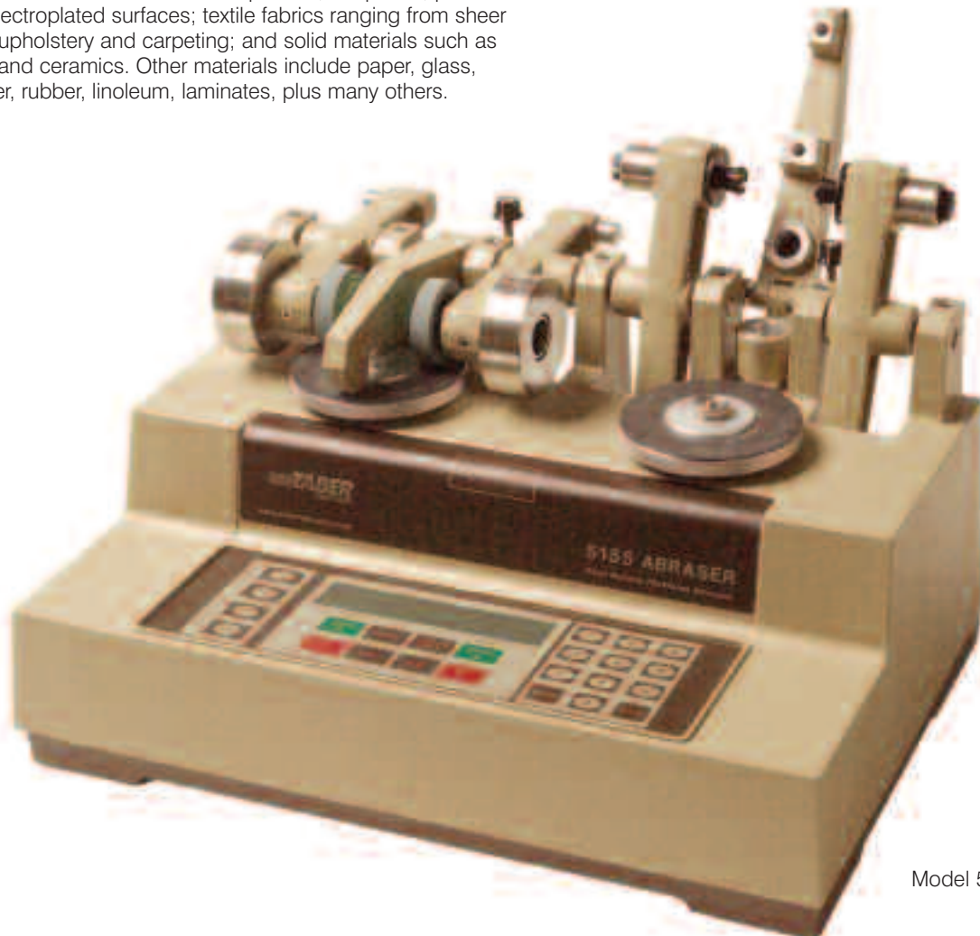
Model 5155 Shown